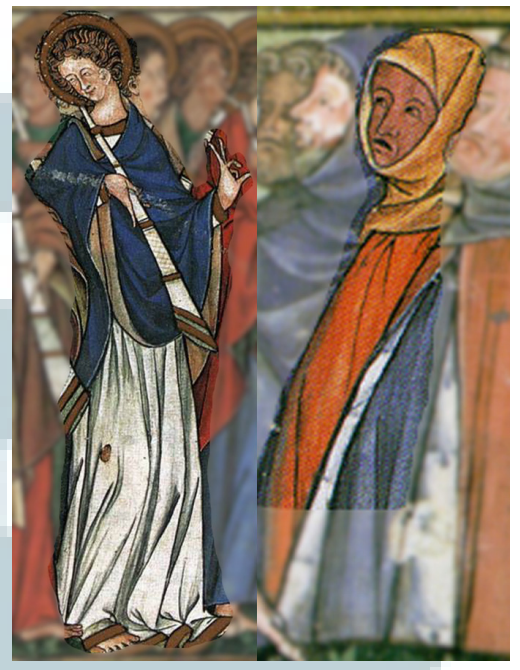
Figure 3. A man in veil.

with Esti is 25 to 35 years old woman with laundress as her job. In addition to this, clothes reference will also be used to make the design process easier.