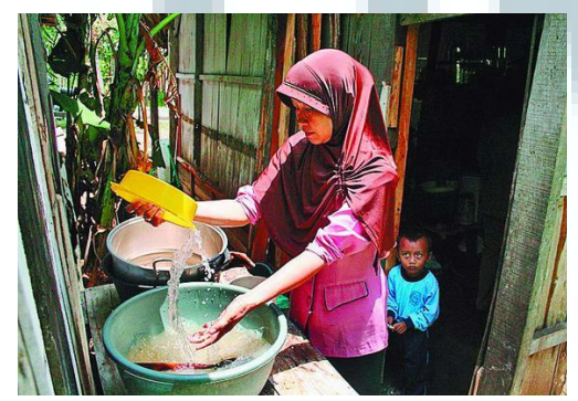
Figure 2. Personal Documentation.

With this three dimention, The reference designate process will be easier. The base reference will be picked from photo of real person with identical background that is previously mentioned. The background that will suit perfectly