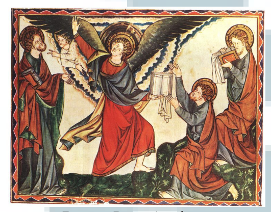
Figure 1. Douce Apoclypse

heads tall. Aside from the height proportion, the body anatomy also drawn not according to the right perpective. Most of the figure has their head drawn facing the side or 3/4 side however the body is drawn facing the front side, their movement also looks stiff and awkward with a